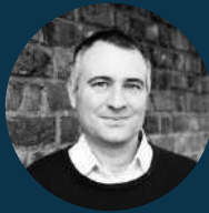
Ben Goldsmith Conservation Collective