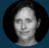
Jade Brudenell Conservation Collective