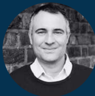
Ben Goldsmith Conservation Collective